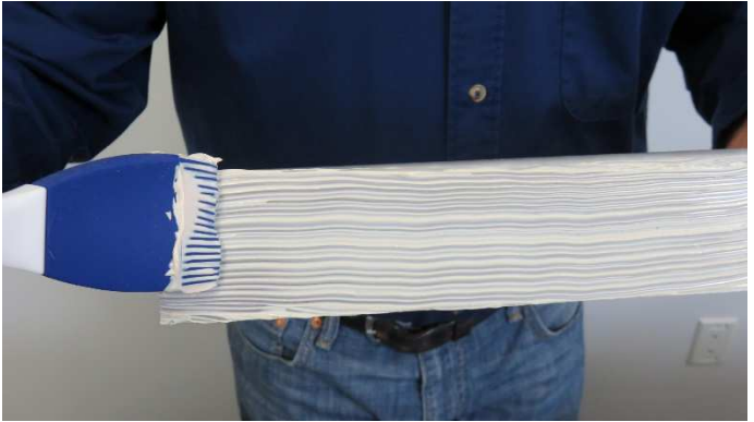
Using the slightly modified basting brush, apply the 946 adhesive to the back of the tread nose and to the face of the step riser. Applying the adhesive in opposite directions, will assist with the adhesive bond. 100% coverage on both the tread nose and step riser must be achieved.