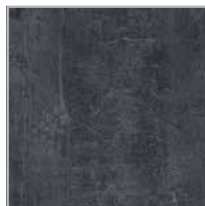
ID70: 24207094 ID55: 24237094 Vintage Zinc | Black B