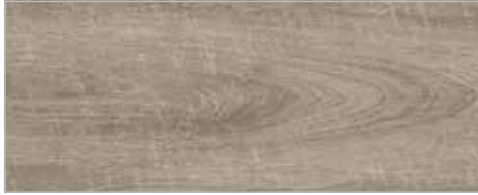
ID70: 24201008 ID55: 24231008 Antik Oak | Middle Grey CB