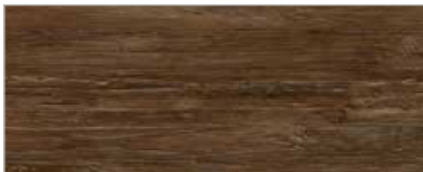
ID70: 24201093 ID55: 24231093 Vintage Teak | Natural WB