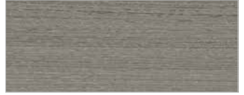
ID70: 24205011 ID55: 24235011 Wenge | Grey CG