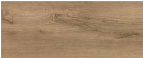
ID70: 24201128 ID55: 24231128 Rustic Oak | Medium Brown WB