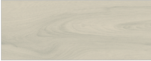
ID70: 24201113 ID55: 24231113 Elm | Light Grey W