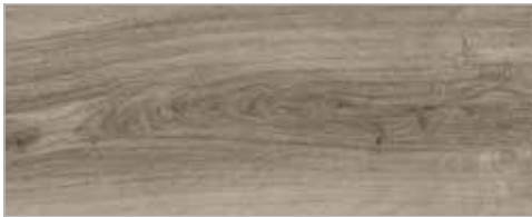
ID70: 24201024 ID55: 24231024 English Oak | Beige CB