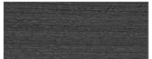
ID70: 24205009 ID55: 24235009 Wenge | Black B