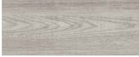
ID70: 24201108 ID55: 24231108 Patina Ash | Grey WG