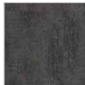
ID70: 24207120 ID55: 24237120 Oxide | Black Steel CG