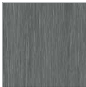
ID 70: 24207088 ID55: 24237088 Trend Line | Black B