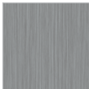
ID70: 24207090 ID55: 24237090 Trend Line | Silver CG