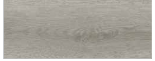
ID70: 24201109 ID55: 24231109 Contemporary Oak | Grey CB