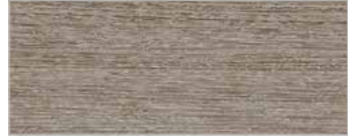
ID70: 24205012 ID55: 24235012 Wenge | Grege CB