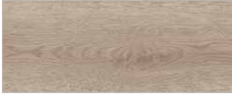
ID70: 24201110 ID55: 24231110 Contemporary Oak | Grege CB