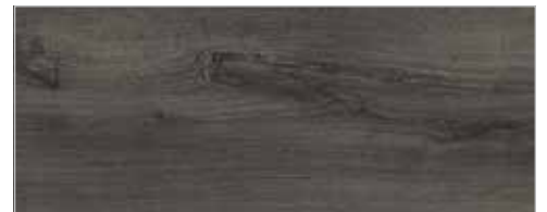
ID70: 24201121 ID55: 24231121 Rustic Oak | Stone Brown