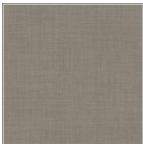
ID70: 24207082 ID55: 24237082 Tissé | Beige CB