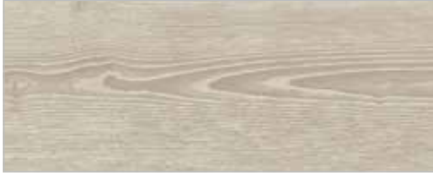
ID70: 24201100 ID55: 24231100 Scandinavian Oak | Light Beige WB