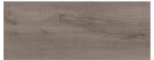
ID70: 24201122 ID55: 24231122 Rustic Oak | Dark Grey CB