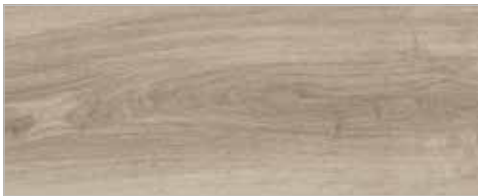
ID70: 24201029 ID55: 24231029 English Oak | Grey Beige CB