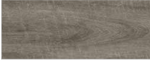
ID70: 24201003 ID55: 24231003 Antik Oak | Dark Grey WG