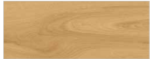
ID70: 24201115 ID55: 24231115 Elm | Natural WB