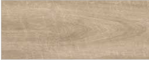
ID70: 24201001 ID55: 24231001 Antik Oak | Beige WB