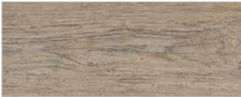
ID70: 24201013 ID55: 24231013 Brushed Pine | Brown WB