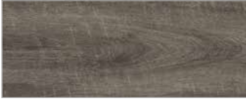
ID70: 24201007 ID55: 24231007 Antik Oak | Anthracite WG