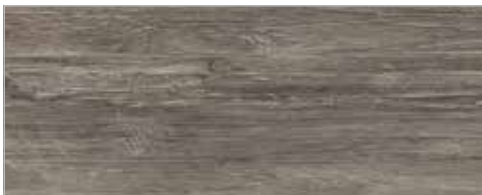
ID70: 24201092 ID55: 24231092 Vintage Teak | Grey CB