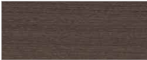
ID70: 242005010 ID55: 24235010 Wenge | Natural