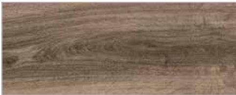
ID70: 24201025 ID55: 24231025 English Oak | Brown WB