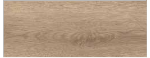
ID70: 24201111 ID55: 24231111 Contemporary Oak | Natural WB